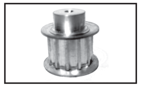
For matching AT5 pitch timing pulleys, see page 83.